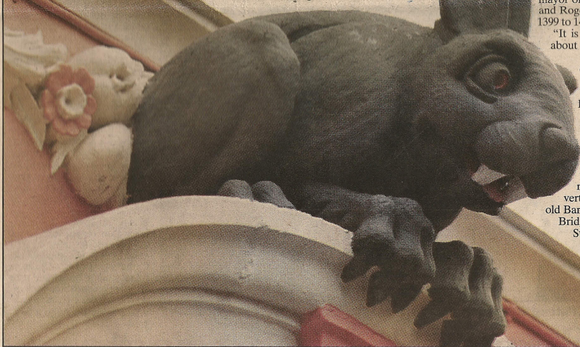
■ Ready to pounce: A vampire rabbit crouches behind St Nicholas Cathedral in Newcastle.

It can be found, perched and snarling, above an office door-