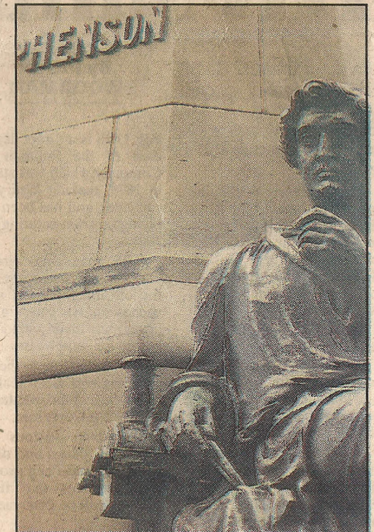
■ Historic: The peek-a-boo locomotive on George Stephenson's statue.