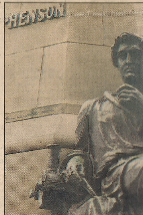
■ Historic: The peek-a-boo locomotive on George Stephenson's statue.