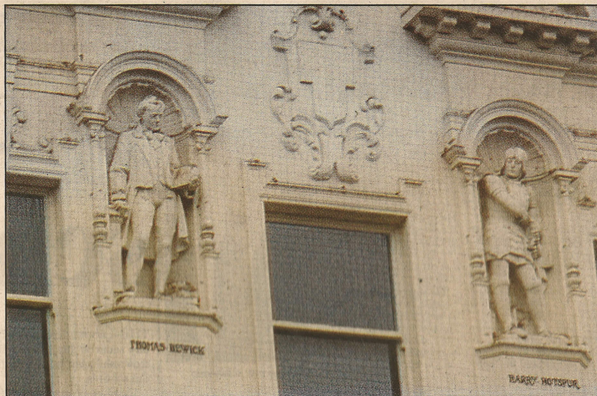
■ Re-discovered: The statues of Thomas Bewick and Harry Hotspur above a Northumberland Street shoe shop.

It can be found, perched and snarling, above an office door-